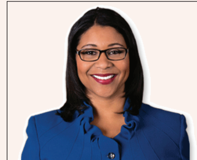
London Breed, Supervisor for District 5