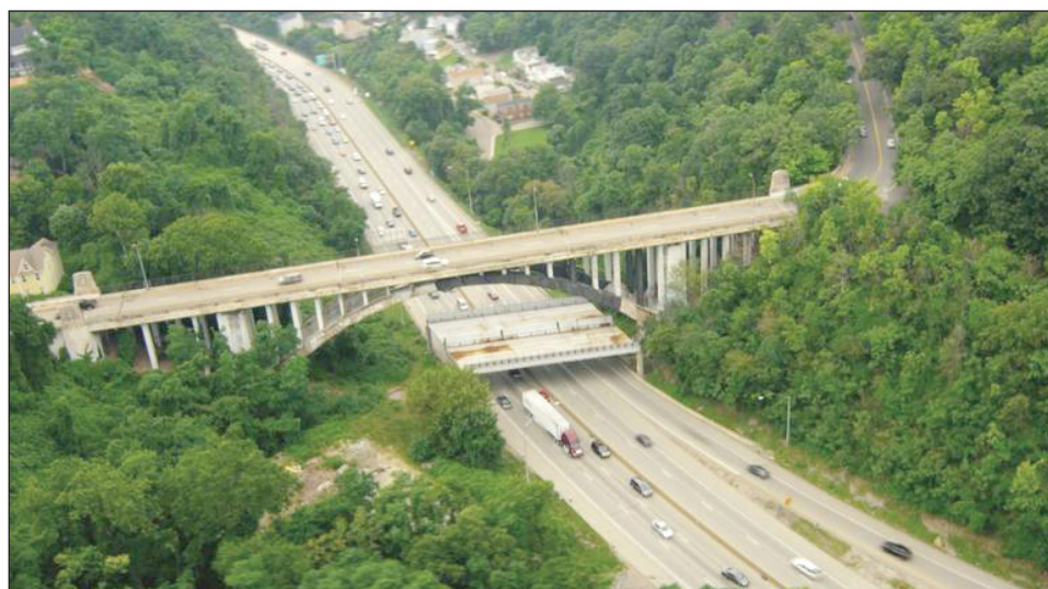
The I-95 bridges in Pittsburgh

Ed Rendell: It's a nation's number one highway. Twenty-two miles of it goes through the city of Phila-